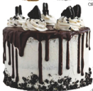
OREO CREPE CAKE